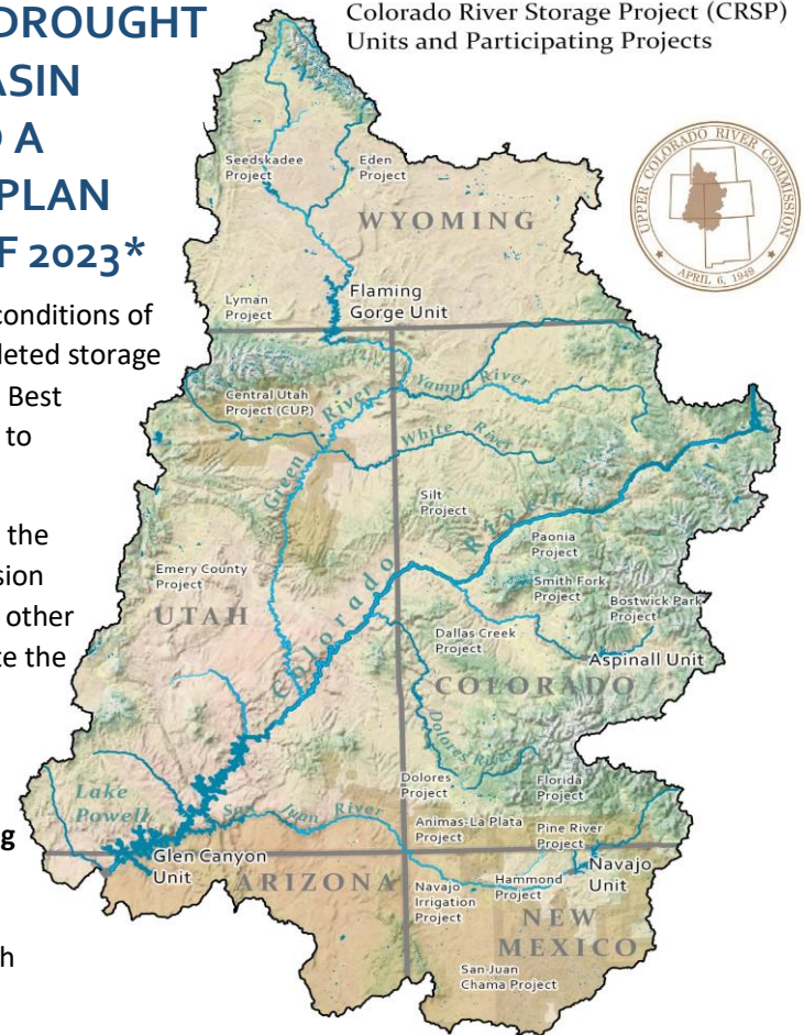
Colorado River Storage Project (CRSP) Units and Participating Projects

In addition to the 161,000 acre-feet provided from Upper Basin reservoirs in 2021, the 2022 Plan authorizes an additional release of 500,000 acre-feet of water from Flaming Gorge Reservoir, beginning in May 2022 and ending in April 2023. The release is intended to address and protect critical infrastructure, dam operations, hydropower, and public health and safety concerns.